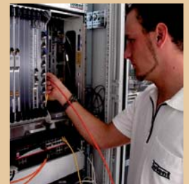
OPERATE 24/7 operation and maintenance Logistics and spare parts management Instruction and training