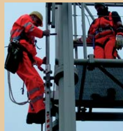
BUILD Project management Installation and commissioning Infrastructure installation Turnkey project execution