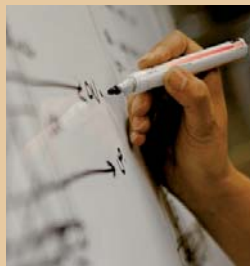
PLAN Consultancy Project planning Project development